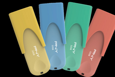
Color Attaché 4