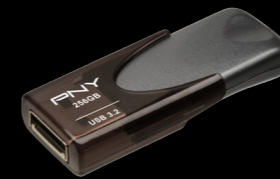
Turbo Attaché 4 USB 3.2