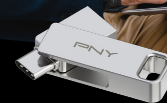
Duo Link Type-C USB 3.2