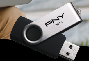
Turbo Attaché R USB 3.2