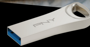
Elite-X USB 3.2